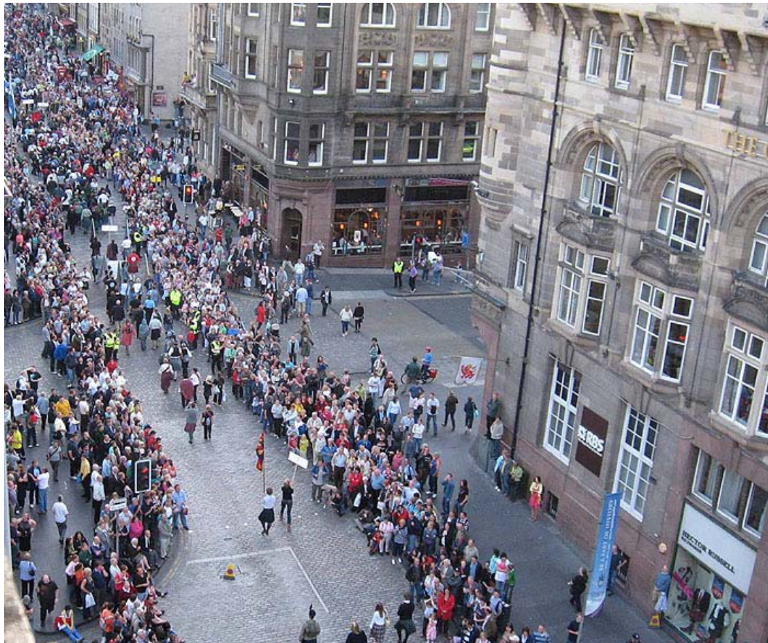
The parade from Holyrood to Edinburgh Castle Saturday Night