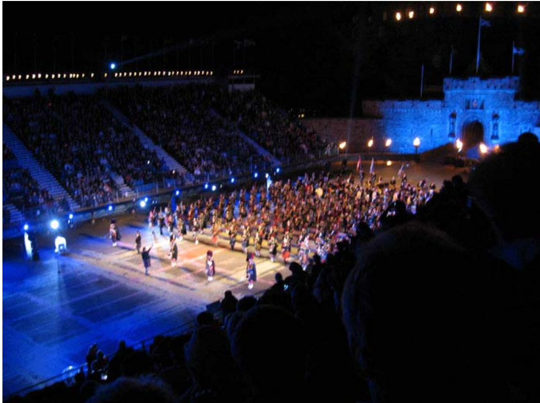
The Pipe Bands playing at Edinburgh Castle